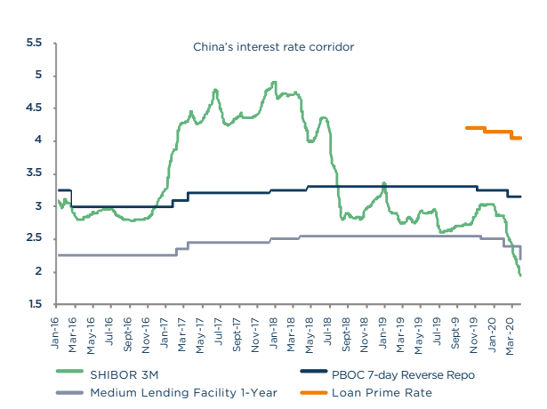
CHART 3 China's interest rate corridor