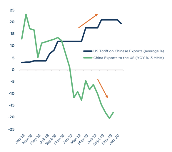
Source: China Customs, Peterson Institute for International Economics, Bloomberg and Coface

to 3% before the trade war started (Chart 2). The case for a V-shaped stabilization is political. The Communist Party of China (CPC) set an ambitious overarching target for President Xi Jinping as part of his inauguration in 2013. The first "centennial target" is to achieve a full xiaokang² economy ahead of the 100th anniversary of the CPC in July 2021. China defines this goal as a doubling of 2010 nominal per capita income figures by 2020 - a hard target that will not be easy to achieve since it requires a yearly growth rate of 5.6%. However, the spread of COVID-19 to Europe and the US, China's largest trading partners, will make this goal unachievable. Both markets account for over 30% of China's total exports and demand will remain anaemic throughout Q2 and Q3 2020, because of capacity closures and mandatory quarantines in those regions. In other words, the external demand shock in Q2 and Q3 will be significant. As a result, the government will have to postpone reaching the centennial target this year. Growth is set to contract sharply by -1.8% YOY